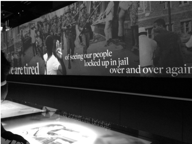
Figure 0.1 “We are tired of seeing our people locked up in jail over and over again” wall projection at the F. W. Woolworth’s diner interactive at the National Museum of African American History and Culture (NMAAHC), Washington DC.

reflection and engagement in the strong themes of resistance and activism on every floor. One exhibition on floor C2 (see Figures 0.1-0.4) considers the time on 1 February in 1960, when four Black students sat in the whites' only Woolworth Lunch Counter, Greensboro, North Carolina. They were refused service but continued to sit "for justice" all day until closing time. The next day twenty-five students arrived to sit for equal rights and refused to move despite being spat at and physically threatened. Over six months increasing numbers of students, Black and white, engaged in passive resistance in the diner until the policy changed. Here on C2, the exhibition features an authentic green stool from the period, a projection of activist events over one wall and a huge interactive lunch counter where visitors sit and work in conversation, to decide together what particular periods of this history to explore and what action they would have taken.