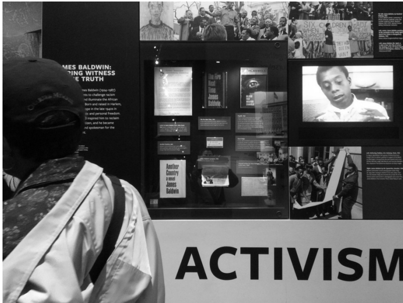
Figure 0.4 “Activism”, James Baldwin section at the National Museum of African American History and Culture (NMAAHC), Washington DC. Photo by Viv Golding, with grateful thanks to the NMAAHC.

The importance of taking action across barriers including ethnicity, gender, class and sexual preference is foregrounded in excellent wall text throughout. Two examples illustrate this point: